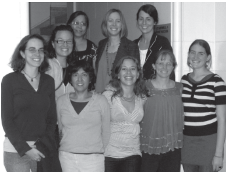
NISGUA staff in our U.S. and Guatemala offices.

• Played a key role in expanding the mandate of the Coordination of International Accompaniment in Guatemala (CAIG) to